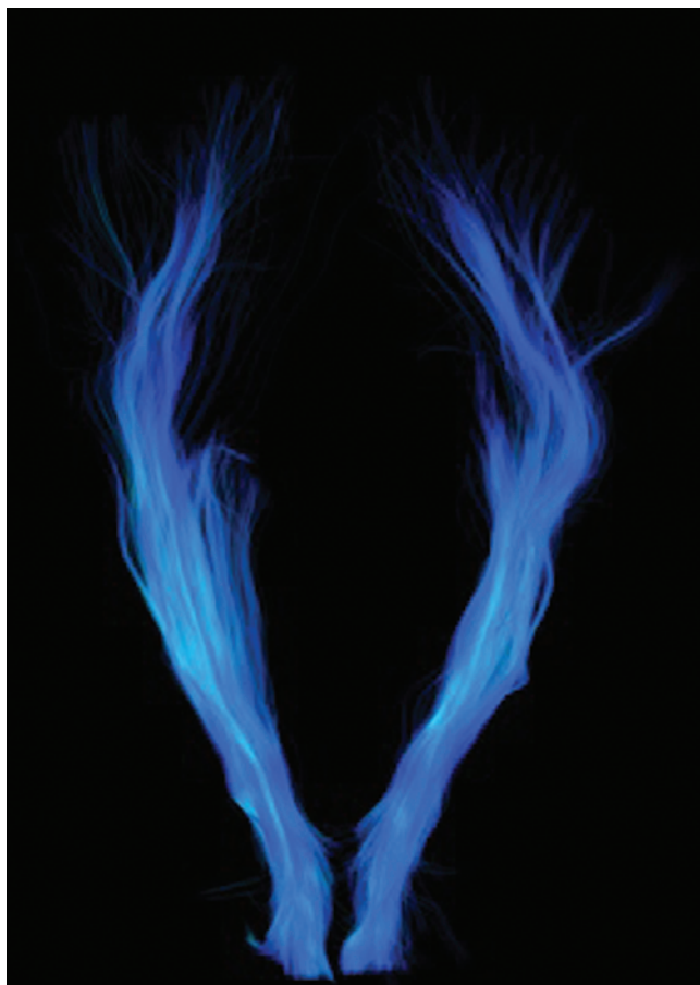
Fig. 2. Tractography of the corticospinal tract of the left and right hemisphere. Tracts were obtained with the Unscented Kalman filter–based 2-tensor tractography algorithm 38,55 to trace fiber paths of the entire brain. Fibers were separately filtered through the precentral gyrus and the anterior pons for each side.

matter changes in both hemispheres, although findings of asymmetry have been observed in some studies. 9 In our cohort, statistically significant effects were only visible in the right hemisphere. This might be due to the fact that we compared preseason and postseason assessment instead of also comparing hockey players to a control group, where we might have found a pronounced overall effect rather than a localized effect within the right hemisphere. Additionally, 56% of all participants reported at least 1 previously sustained concussion before entering the study. Therefore, the results of this study may only reflect additional changes in white matter alterations over the course of 1 season, because the effects of mild TBI might have already been present in the majority of participants. In this context, the right hemisphere may be more susceptible to diffuse axonal injury than the left, where changes might not be as pronounced within the investigated group of athletes. However, the interpretation of findings of white matter alterations in the right hemisphere is at best speculative. Further studies are needed, including complete information regarding the laterality of sustained impacts to the head, which may provide the necessary link between injury mechanism and the location of white matter alterations in sports-related concussion.