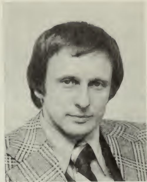
The Honourable Rene Brunelle Minister of Community and Social Services Province of Ontario Parliament Buildings Toronto, Ontario